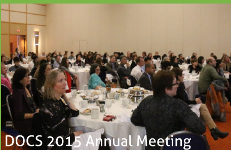
DOCS 2015 Annual Meeting

Last year DOCS was incorporated as an official 501 (c) (3) nonprofit organization. We also opened a small business bank account and now have an easy way for people to pay us online through our website. The 2015 annual DOCS meeting in Baltimore set a new record with 145 attendees. Our overall income from the 2015 meeting fees was $17,545.78 and our overall expenses for the 2015 meeting were $13,293.07. Adding to our previous balance, DOCS currently has $10,406.60 in the bank.